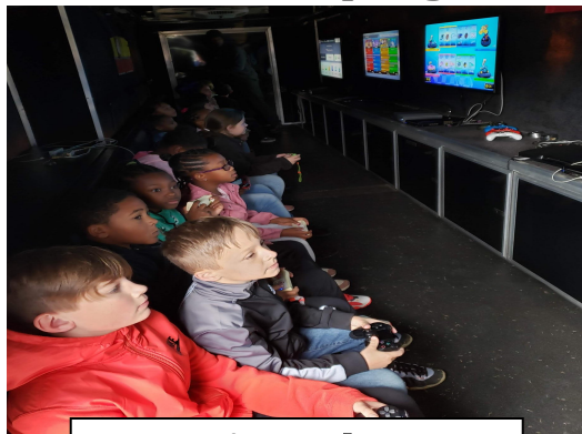
Gaming Truck PBIS Celebration