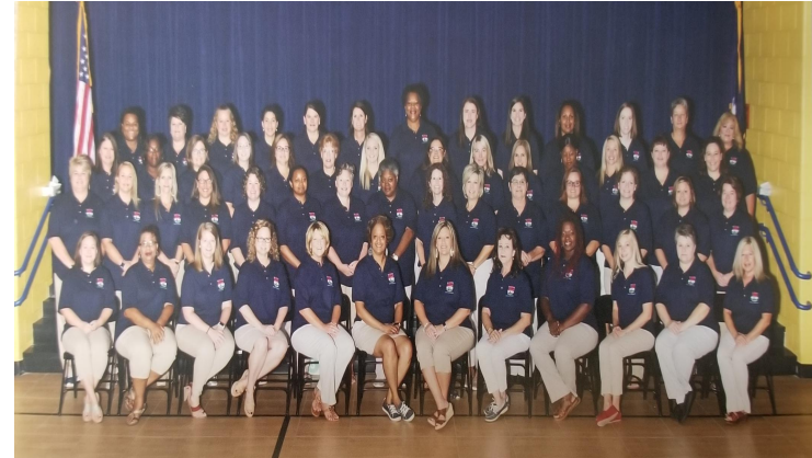
2019-2020 LES Faculty