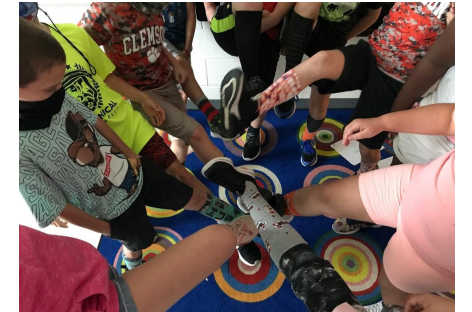
“Sock it to Drugs”