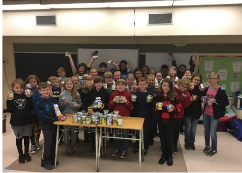
Beta Club Food Drive