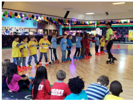
Skateland PBIS Celebration