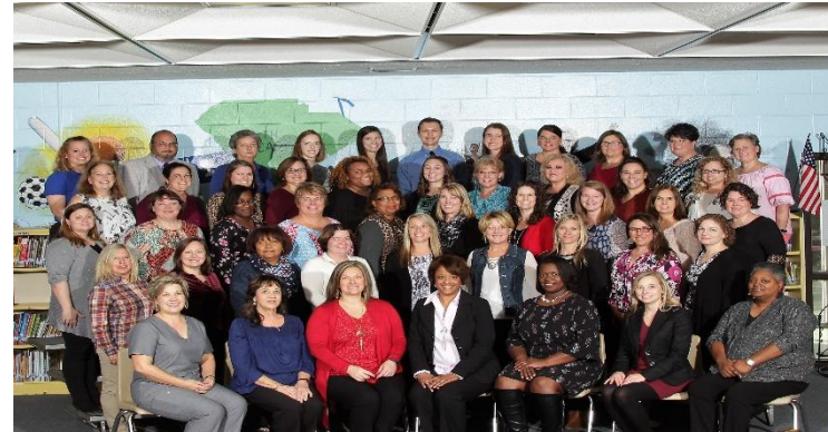
2018-2019 LES Faculty