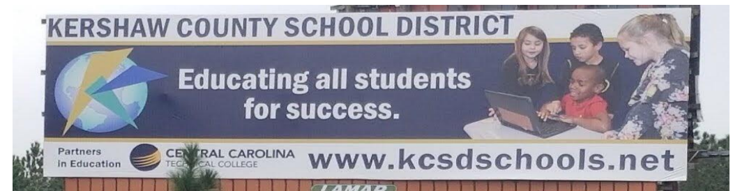
Kershaw County School District Billboard on I-20 featuring Lugoff students.