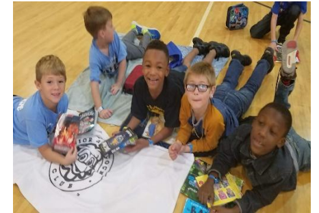
Reading at KCSD Read-In