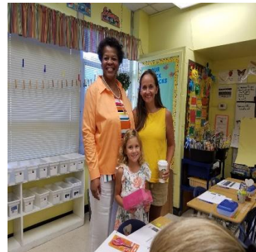
Welcome Back Night!