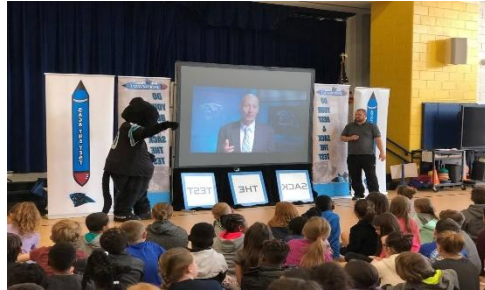
Beta Club Food Drive