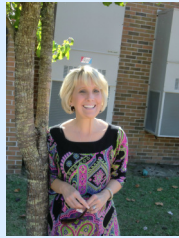
LES Reading Teacher of the Year