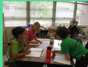
Building Aquariums in Science