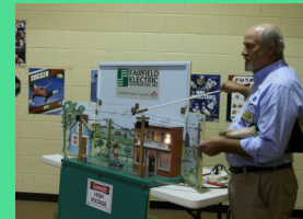
Learning About Electricity