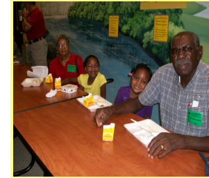
Grits for Grandparents