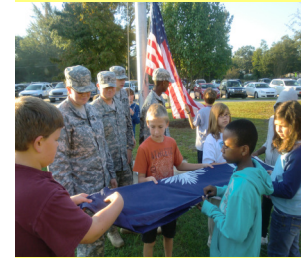
Learning How to Fold The Flags