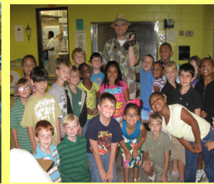
"The Snake Man"