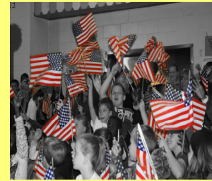
Veteran's Day Program