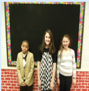
LES Superintendent's Writing Winners