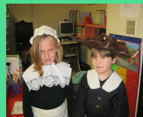
Pow Wow Day