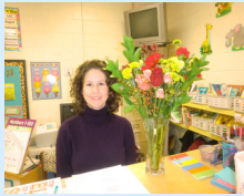
LES Teacher of the Year