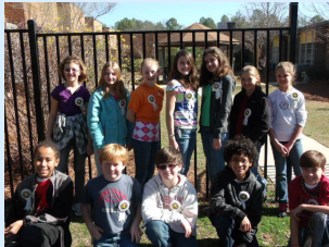
Science Fair Winners