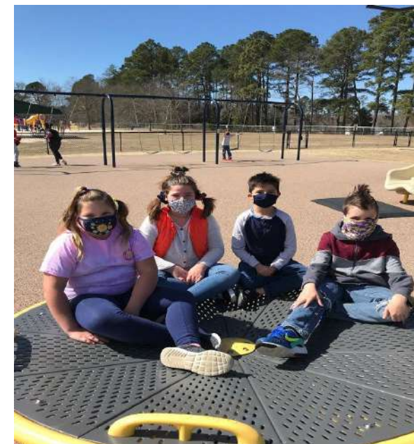
“Crazy Hair Day”-Dr. Seuss Week