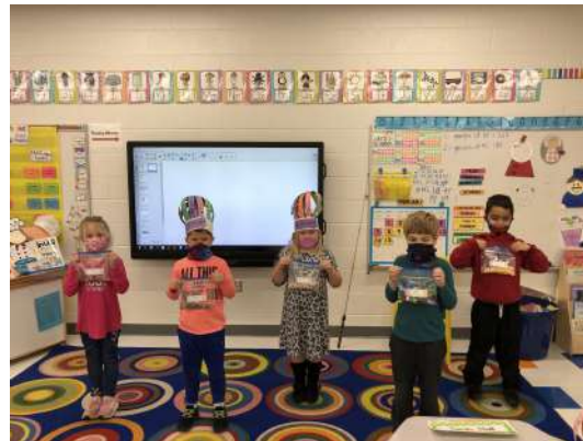
100th Day of School