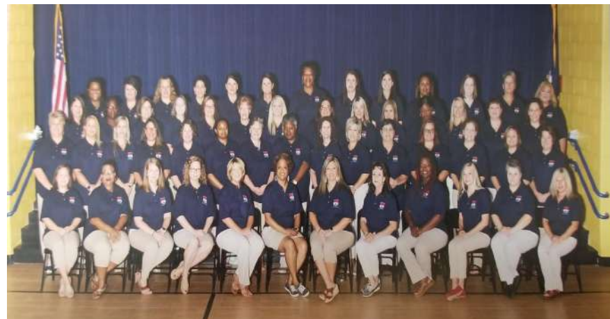
2020-2021 LES Faculty