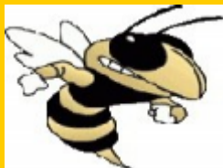
Yellow Jacket Pride

Buford Middle School School Improvement Officers