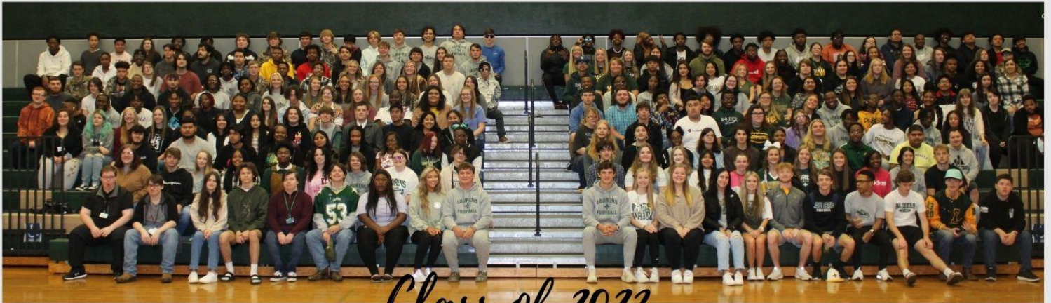
Class of 2023