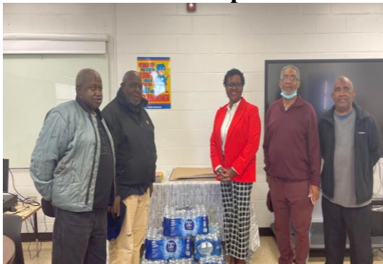
Mt. Pleasant A.M.E. Church-Lynchburg, SC: Donates monthly bottled water for students.