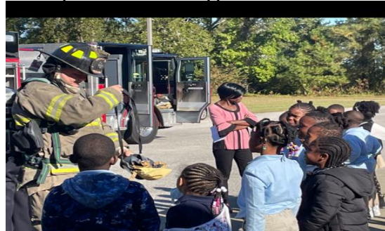
Bishopville Fire Department: Fire Safety Month