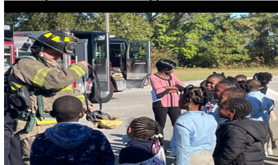
Bishopville Fire Department: Fire Safety Month