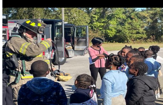
Bishopville Fire Department: Fire Safety Month