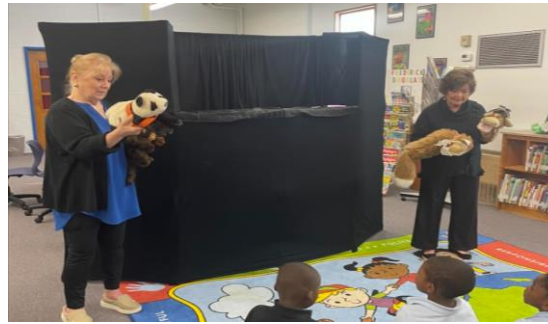
Bishopville Pilot Club: Puppet Show for students