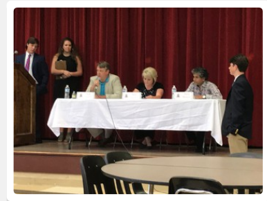
2018 Board Candidates Forum hosted by Gilbert High School SIC