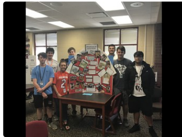
Creating a Better World Through Community Service