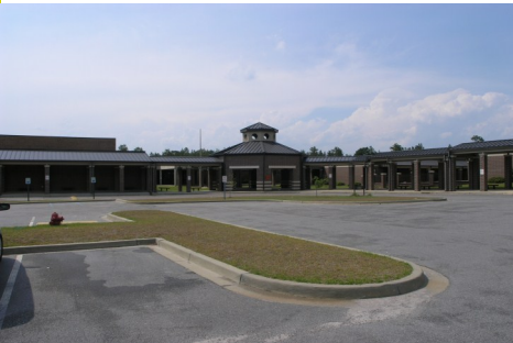
Pelion Elementary School

The mission of Pelion Elementary School, where Panthers AchiEve LeaderShip , is to inspire students to achieve their maximum potential in a high performance learning culture through academics, technology, the arts and athletics. Therefore, in this endeavor, we will work to prepare our students to be caring, independent and responsible citizens in an ever-changing world. This is accomplished by working with families and the community to provide a supportive environment, challenging educational experiences, and opportunities to explore the various areas of our world, while learning to help and serve others. Panther Pride 100%!