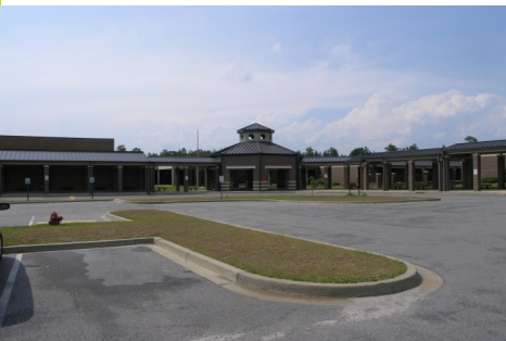
Pelion Elementary School

The mission of Pelion Elementary School is to inspire students to achieve their maximum potential in a high performance learning culture through academics, technology, the arts and athletics. Therefore, in this endeavor, we will work to prepare our students to be caring, independent and responsible citizens in an ever-changing world. This is accomplished by working with families and the community to provide a supportive environment, challenging educational experiences, and opportunities to explore the various areas of our world, while learning to help and serve others.