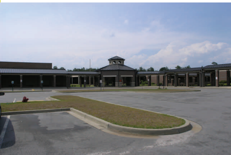
Pelion Elementary School

The mission of Pelion Elementary School is to inspire students to achieve their maximum potential in a high performance learning culture through academics, technology, the arts and athletics. Therefore, in this endeavor, we will work to prepare our students to be caring, independent and responsible citizens in an ever-changing world. This is accomplished by working with families and the community to provide a supportive environment, challenging educational experiences, and opportunities to explore the various areas of our world, while learning to help and serve others.