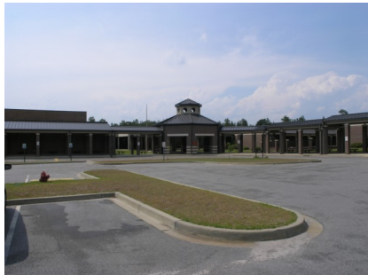
Pelion Elementary School

The mission of Pelion Elementary School is to inspire students to achieve their maximum potential in a high performance learning culture through academics, the arts and athletics. Therefore, in this endeavor, we will work to prepare our students to be caring, independent and responsible citizens in an ever-changing world. This is accomplished by working with families and the community to provide a supportive environment, challenging educational experiences and opportunities to explore the various areas of our world, while learning to help and serve others.