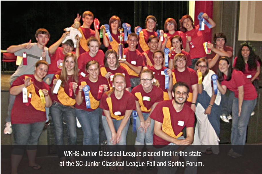
WKHS Junior Classical League placed first in the state at the SC Junior Classical League Fall and Spring Forum.