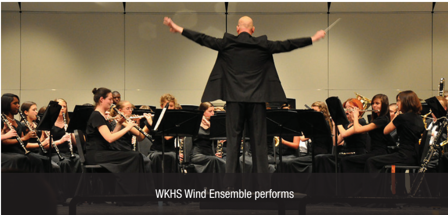
WKHS Wind Ensemble performs

One student won second place in the Picasso Project. Her artwork will be auctioned off to raise money for the South Carolina Children's Trust.