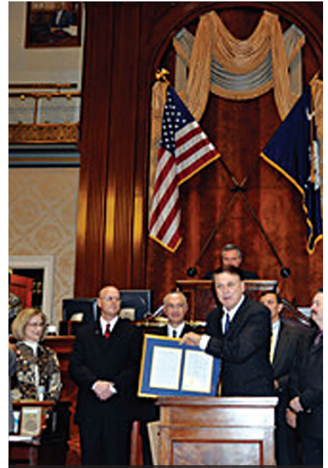
WKHS Marching Band was recognized at the State House as 2010 South Carolina AAAA State Marching Band Champions.