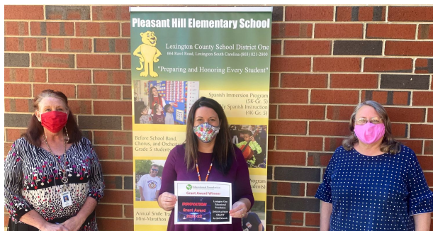
Lexington One Educational Foundation Innovation Grant