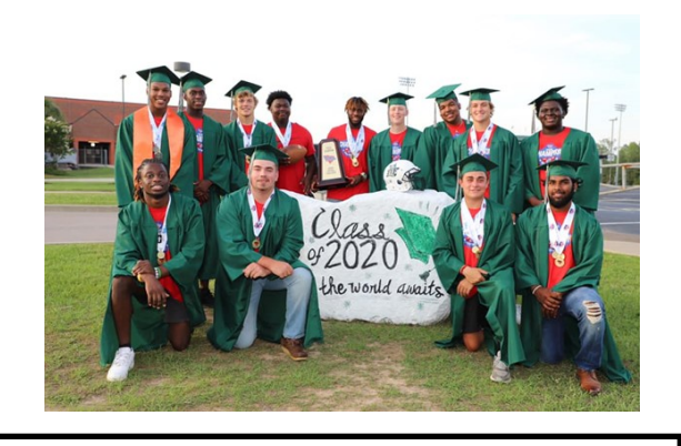
And Many Many Accomplishments ....