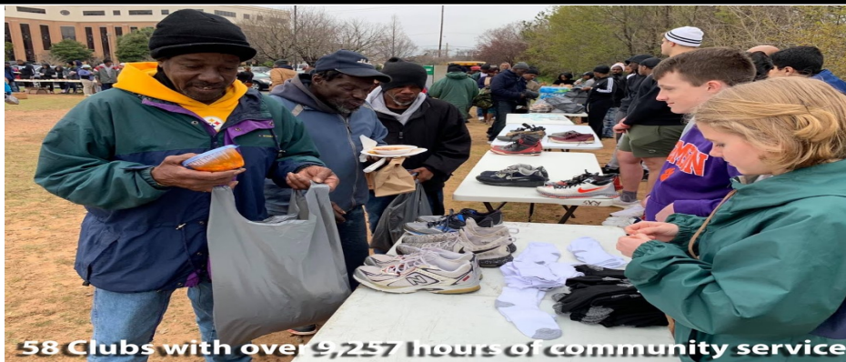
58 Clubs with over 9,257 hours of community service