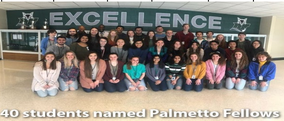
40 students named Palmetto Fellows