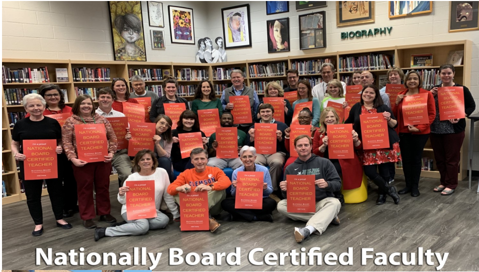
Nationally Board Certified Faculty