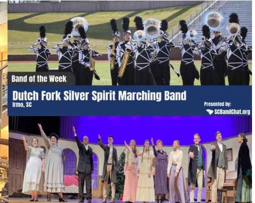
DFHS Drama presented Little Women