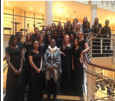
DFHS performed in Chicago