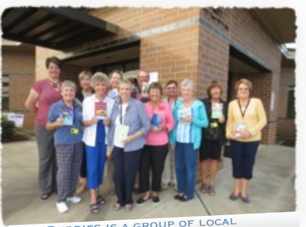
BOOK BUDDIES IS A GROUP OF LOCAL VOLUNTEERS THAT ENCOURAGE LITERACY