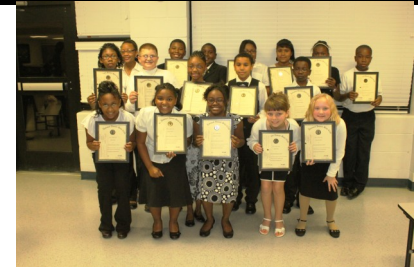
Seventeen students were inducted into the Junior Beta Club.