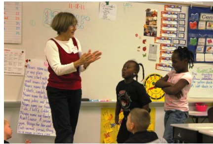
The McCormick Arts Council works with students on acting out stories. Community partnerships are vital to the education of our students.