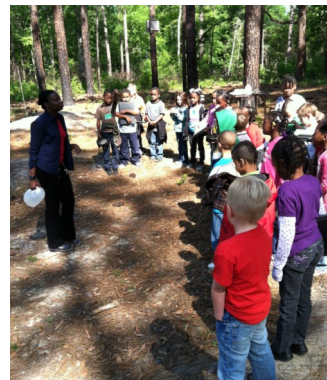
Field trips provide opportunities for our students to apply their learning.