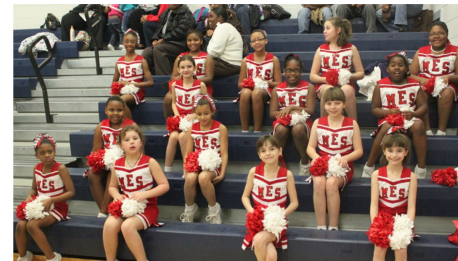
Cheerleading is one of the many clubs MES offers for students.