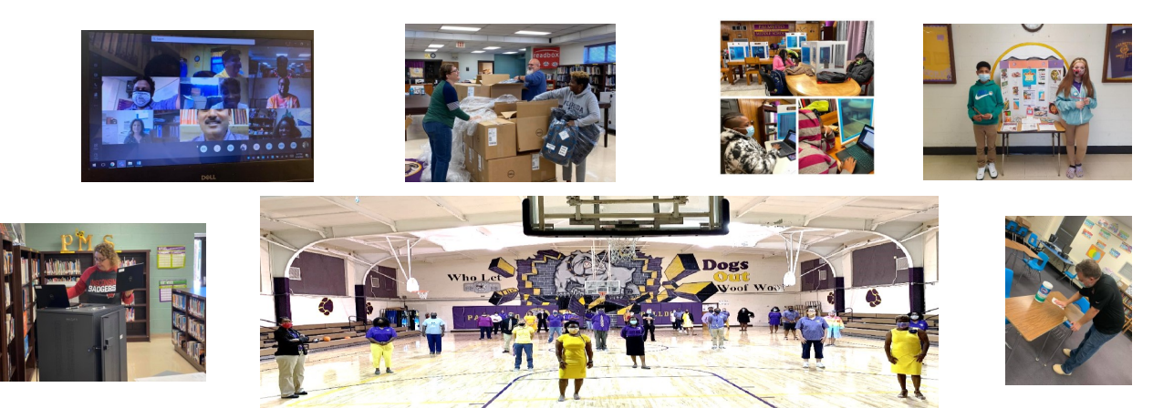
Palmetto Middle School: Moving Forward! Growing Together! Getting Better!