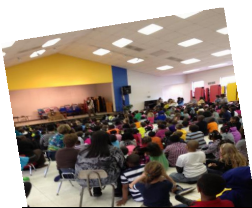
Storyteller Granddaddy Junebug's visit