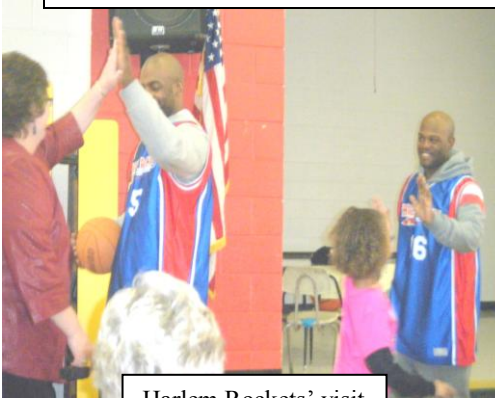
Harlem Rockets' visit