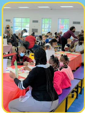
Art & Chat

This year, she has implemented many new initiatives, workshops, and activities to enhance student, teacher, and parent relationships!