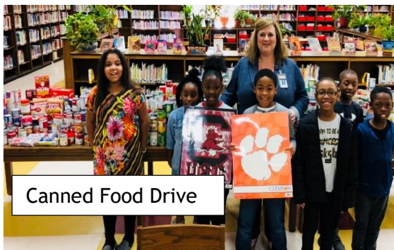
Canned Food Drive