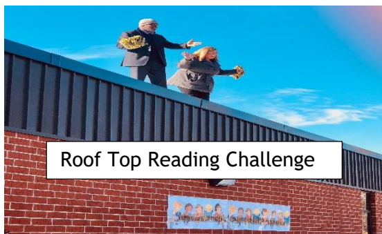
Roof Top Reading Challenge