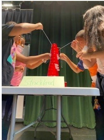
Academic Opportunities STEM Challenges

BIS- BUILDING INNOVATIVE STUDENTS THAT LEAD