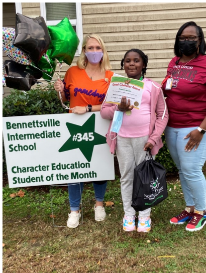
Character Education Recognition