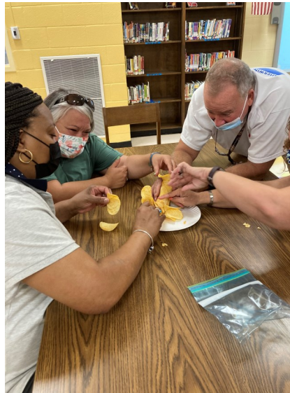
STEM Professional Development