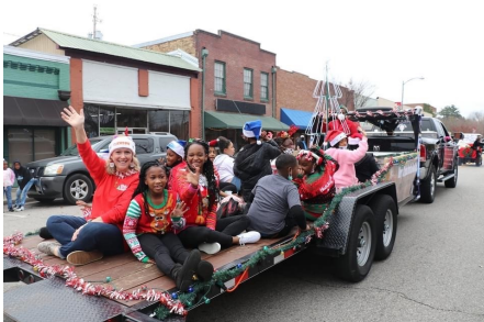
Community Involvement Holiday Parade