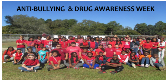
ANTI-BULLYING & DRUG AWARENESS WEEK