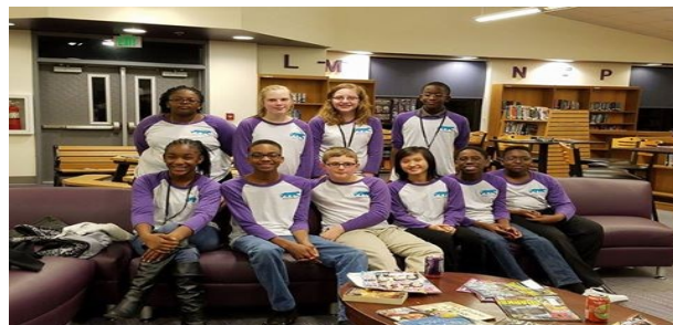
ACADEMIC CHALLENGE TEAM