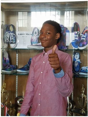
GT ART STUDENTS SHOWCASE THEIR GALAXY SHOES