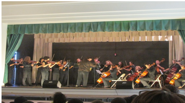
SC GOVERNOR'S SCHOOL FOR THE PERFORMING ARTS VISITS OUR SCHOOL