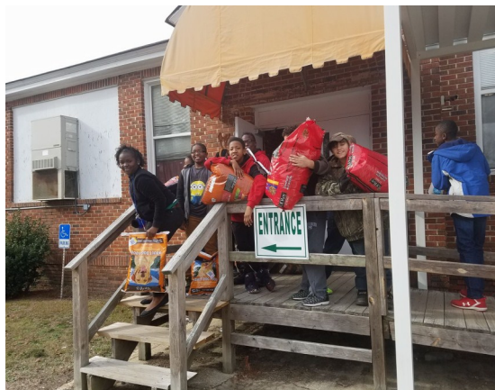
PET FOOD DRIVE