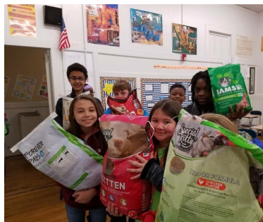
PET FOOD DRIVE