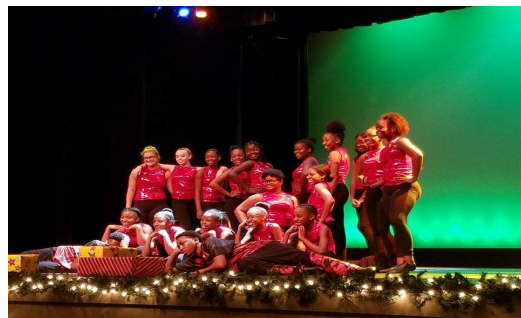
Dance Winter Performance