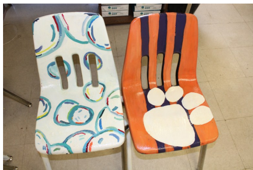
Chairs painted by our Art students