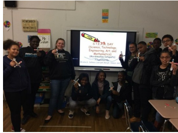
First Annual STEAM Day