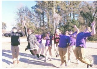
Academic Challenge Team