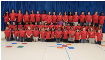
ACE Team Students scoring Exemplary on SCPASS