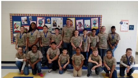
GES Archery Team