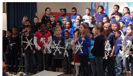
Students performing in the Winter Program