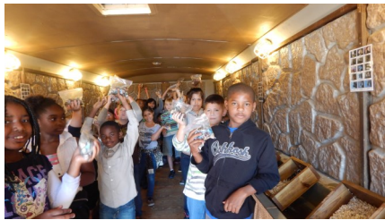
GES 3rd grade students enjoy mining for rocks with