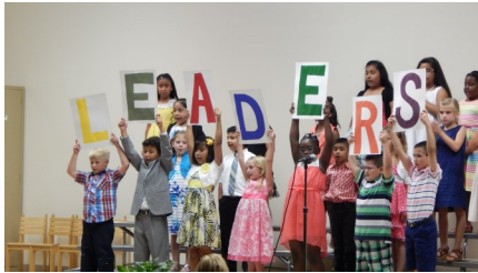
Students sharing information about The Leader In Me