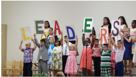
Students sharing information about The Leader In Me