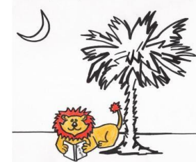
The "Pride" of the Palmetto

381 South Wheeler Avenue Prosperity, SC 29127 (803) 364-2321/2678 (803) 364-4484 Fax www.newberry.k12.sc.us