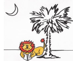
The "Pride" of the Palmetto

381 South Wheeler Avenue Prosperity, SC 29127 (803) 364-2321/2678 (803) 364-4484 Fax www.newberry.k12.sc.us