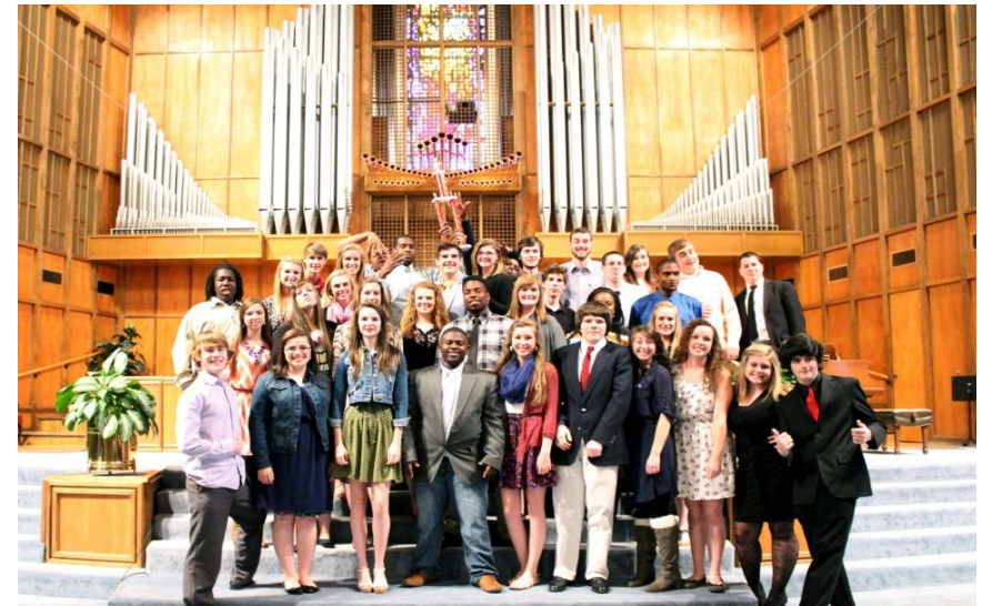
2010, 2011, 2012, and 2013 Choral State Champions