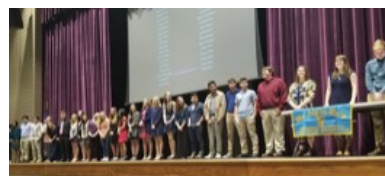
Mu Alpha Theta