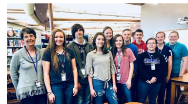
Foundations of World History Students