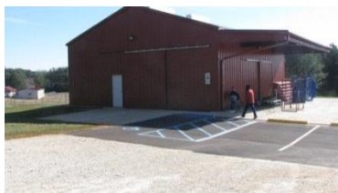
S.C.'s only approved School Barn