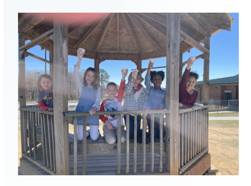
First grade students enjoying snow cones on St. Patrick's Day.