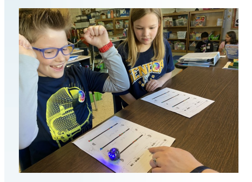
Students engaging in a lesson with Ozobots!