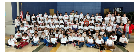
Our 5th Grade D.A.R.E. Graduates.