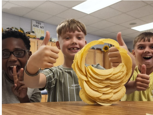
Students practiced their teamwork with the Pringles Challenge to mathematically find the radius of the curvature of a Pringles chip!