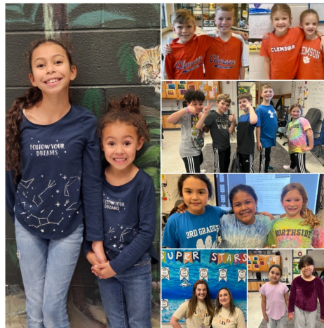
Students celebrating "There for you Thursday" (dress like a buddy) during Kindness Week.