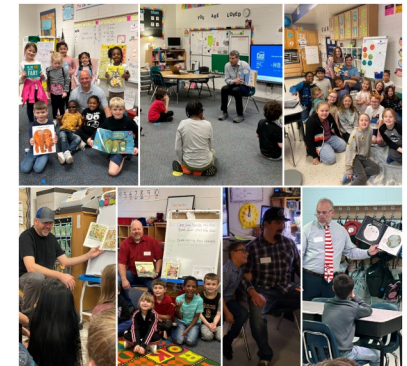
Our inaugural Real Men Read event concluding Read Across America Week.