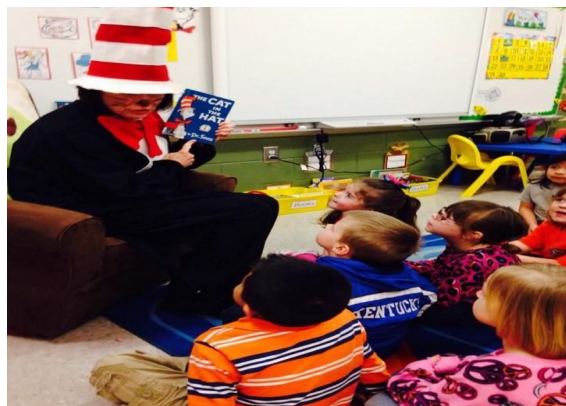
The cat from Dr. Seuss' The Cat in the Hat makes annual visits to our classrooms to read books.