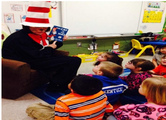
The cat from Dr. Seuss' The Cat in the Hat makes annual visits to our classrooms to read books.