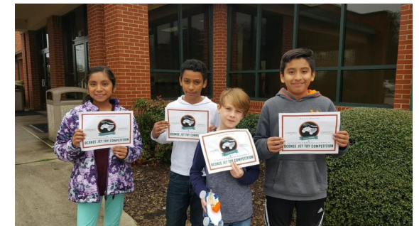
Pictured above are four JMB students who participated in the district Jet Toy competition.

National Beta Club School of Merit Participation in Jet Toy Participation in Math Madness Participation in Future Chef House traditional beehive and apiary for district Raised over $7500 for American Heart Assoc. Held two family nights with high attendance Partnership with Clemson Hope Partnership with Mentoring Upstate Title 1 School