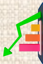
BBES SC Ready Science 2022 and 2023