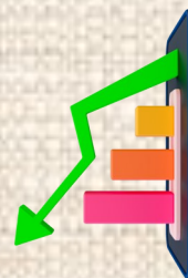
BBES SC Ready Science 2022 and 2023