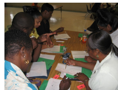
Professional Development for Faculty & Staff