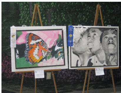
Award-winning artwork from W. J. Clark students

The Goal of William J. Clark Middle School is to make academic achievement a daily priority!