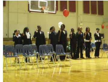
Student Government Association Induction Ceremony

I pledge my loyalty to William J. Clark, where we "Sprint Towards Excellence and Dream the Same Dream." I will have respect , be responsible and safe , and do things orderly . Proudly, I will display the "Hound" in me! Through my actions, I will determine the length and speed of my sprints, the height of my leaps, and the width of my bounds! I will act, look, learn, and do my best as a member of the Clark Greyhounds' Dream Team!