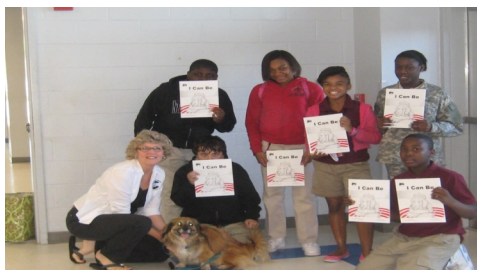
Healing Species—6th Grade Students