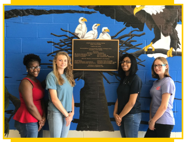
NMHS Senior Scholars

North Middle/High School is proud to announce that it is an official AVID site. AVID Advancement Via Individual Advancement -- an elective course offered at our middle school level. This course will prepare students for the rigors of college prep classes by providing study and organizational skills as well as tutorial help from high school honor students. Teachers of the AVID Elective course received extensive training in the AV-ID structures and system during a Summer Institute, as well as follow-up training during the school year. AVID teachers will engage in another Summer Institute this June. AVID is open to select students grades 6-8 and supports the transition of ninth and tenth graders into a middle college curriculum.