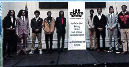
100 Black Men Lunch Buddies