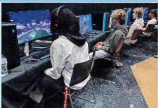
E-Sports (new in 2024-2025)