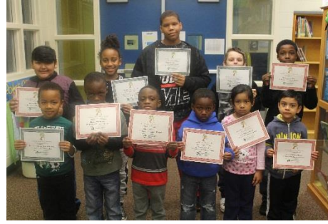
Arbor Day Art Contest Winners