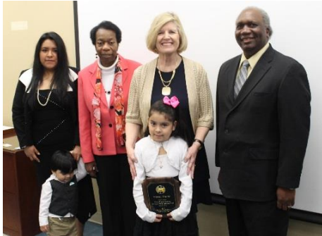
Third Place Winner in the 2017 School Bus Safety Poster Contest Division One Category

Winner - 2017 Lights On Afterschool Poster Contest