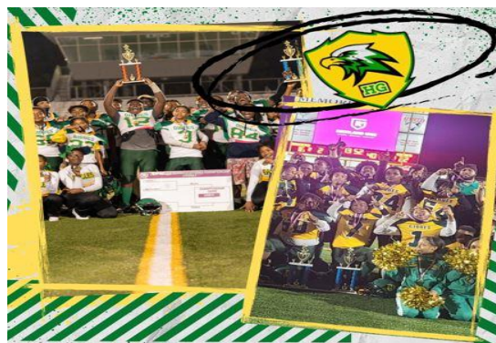
2023 and 2024