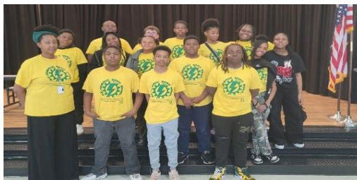
Quiz Bowl Team