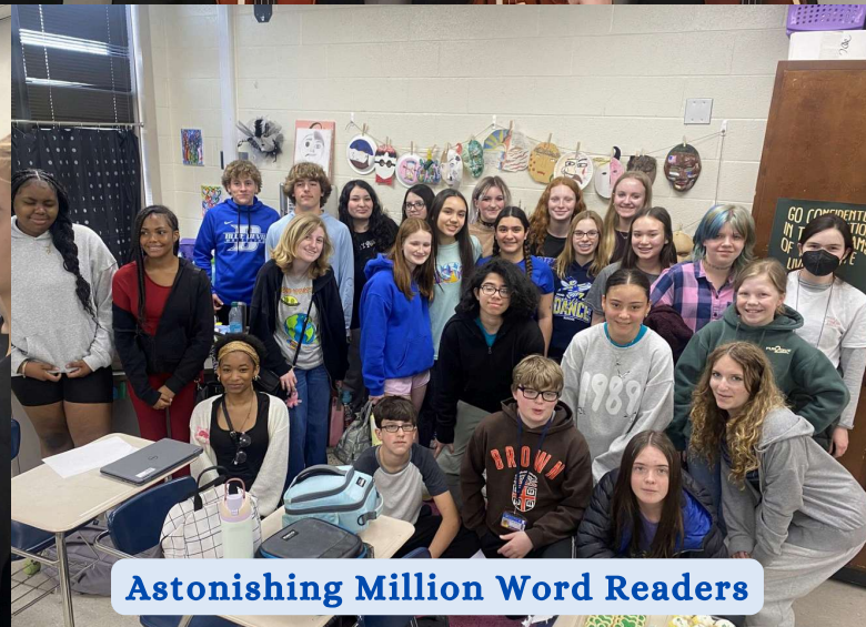
Astonishing Million Word Readers