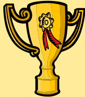
Awards, Honors and Recognitions

WEBBER ELEMENTARY SCHOOL WILL PREPARE EVERY STUDENT TO BE A CONTRIBUTING CITIZEN IN A GLOBAL SOCIETY BY PROVIDING AN EFFECTIVE AND HIGH QUALITY EDUCATION.