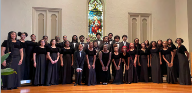
Blazer Chorus rated Superior with Distinction