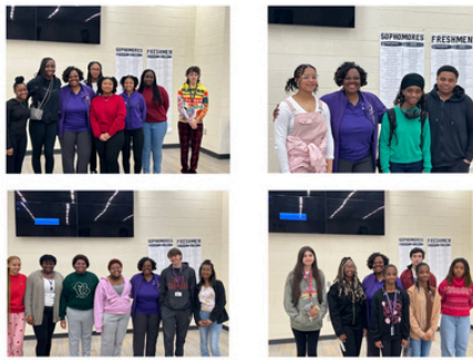
Principals A Honor Roll