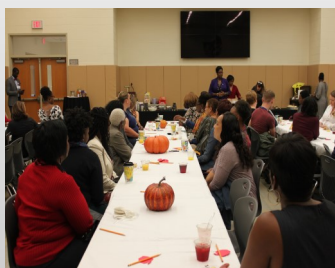
Moments for Moms 2017