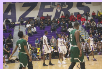
Bojangles' Bash 2017