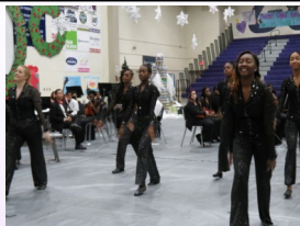
Holiday Arts Festival