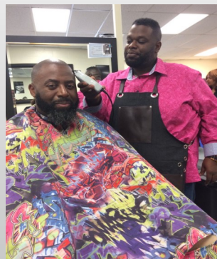
Cuts for Gabbiee 2017