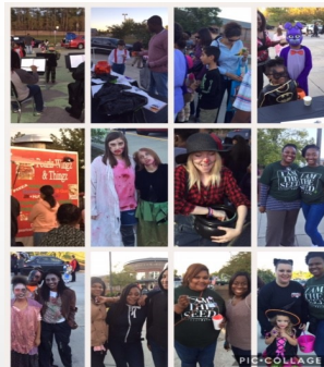
Trunk or Treat 2017