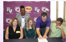
Signing Day 2017