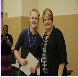
Student of the Month