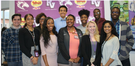
Palmetto Fellows 2017-2018