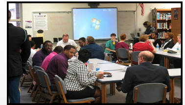
Career Day 2018