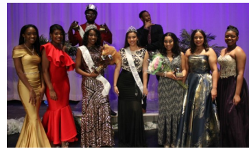
Mr & Miss Ridge View