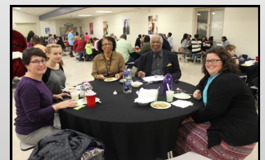
Giving Bowl 2017