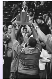
State Basketball Champs