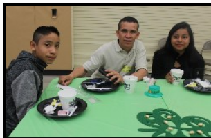
Feast for Fathers 2018