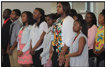
National Honor Society