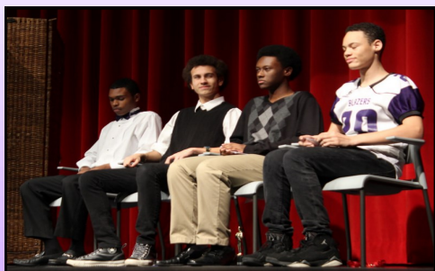
"The Dating Game" Freshman Parent Information Night