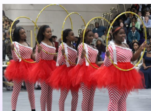
Winter Wishes 2015