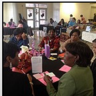
Mother Daughter Tea