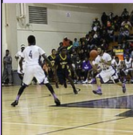
Bojangles Bash 2015