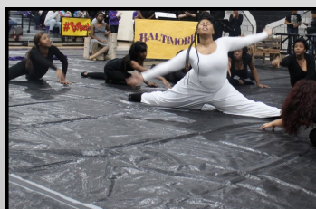
Black History Program 2016