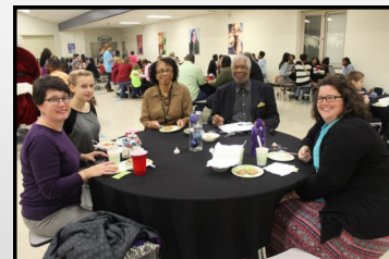
Giving Bowl 2015