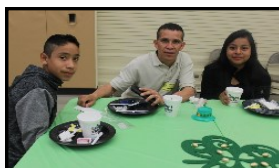
Feast for Fathers 2016