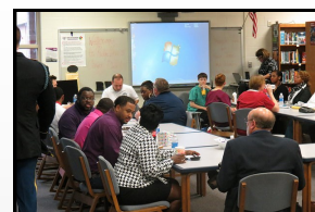
Career Day 2016