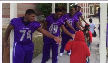
Blazer Football @ RCE