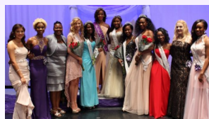
Miss Ridge View