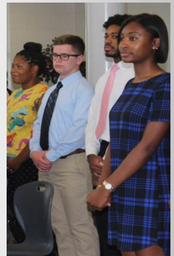
National Honor Society Induction

“Our aim is to build each student’s experiences towards a better future.”