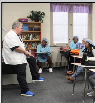
Through our Summer Reading Celebration program, students connect to lifelong literacy by discussing books that they selected to read over summer break.