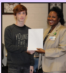
Student of the Month