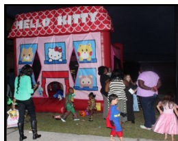
Trick or Trunk 2015